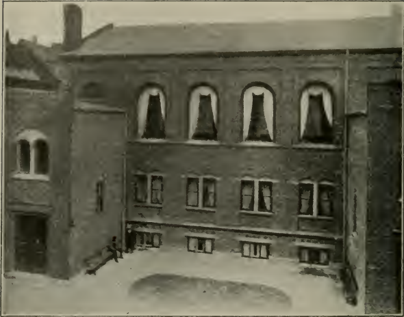
MISSION HOUSE OF THE LATTER-DAY SAINTS, AT COPENHAGEN, DENMARK.